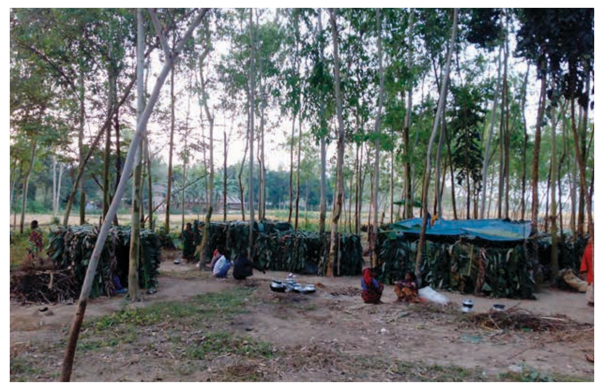
Santal community members are living in inhumane conditions, in slums made of banana leaves, after the destruction of their makeshift huts by police.