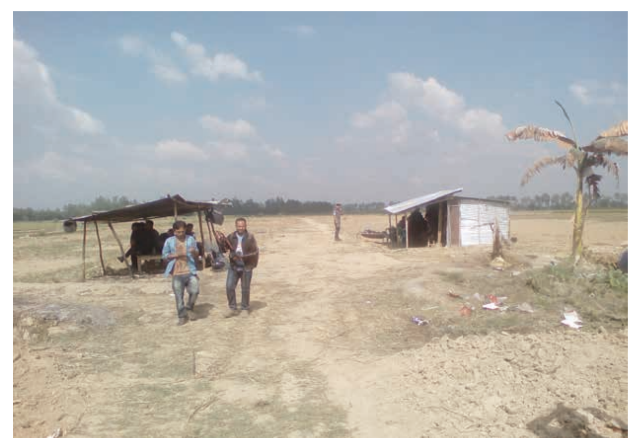
Police posts inside the sugarcane plantation.

On 1 September 2016, when mill workers went to the sugarcane plantation, Santal community members attacked and beat the mill workers.<sup>74</sup> The Santal frequently assaulted mill workers during their visits to the area.<sup>75</sup> This situation continued to escalate and, on 7 October 2016, the Santal conducted a demonstration in the plantation area, during which the Santal attacked the police outpost situated on the plantation.<sup>76</sup>