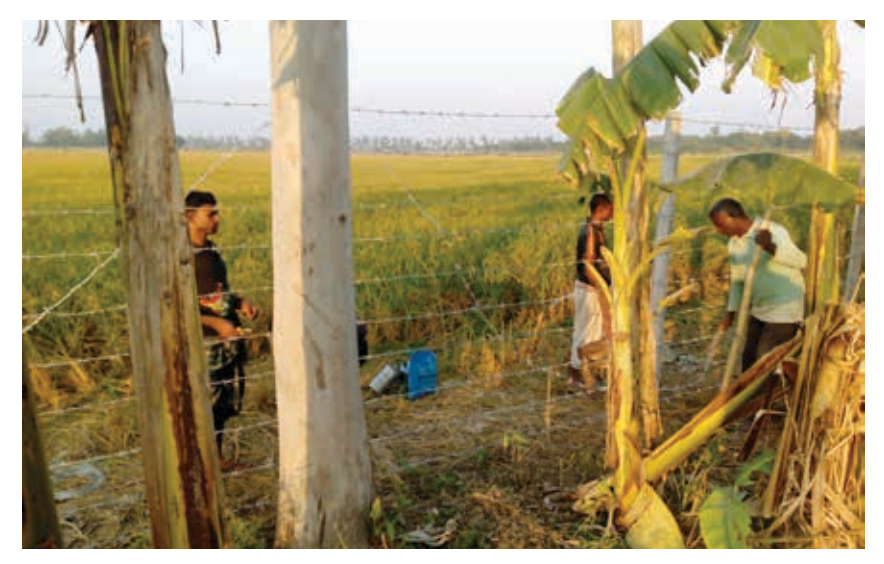
Rangpur Sugar Mills surrounded the farmland with barbed wire.

On 7 November 2016, Rangpur Sugar Mills workers plowed the land where the huts had been destroyed with tractors and planted rice in order to remove any evidence of the burned huts. The remaining belongings of the Santal were looted by Rangpur Sugar Mills workers in the presence of police.<sup>101</sup> Rangpur Sugar Mills workers also fenced off the whole area with barbed wire.