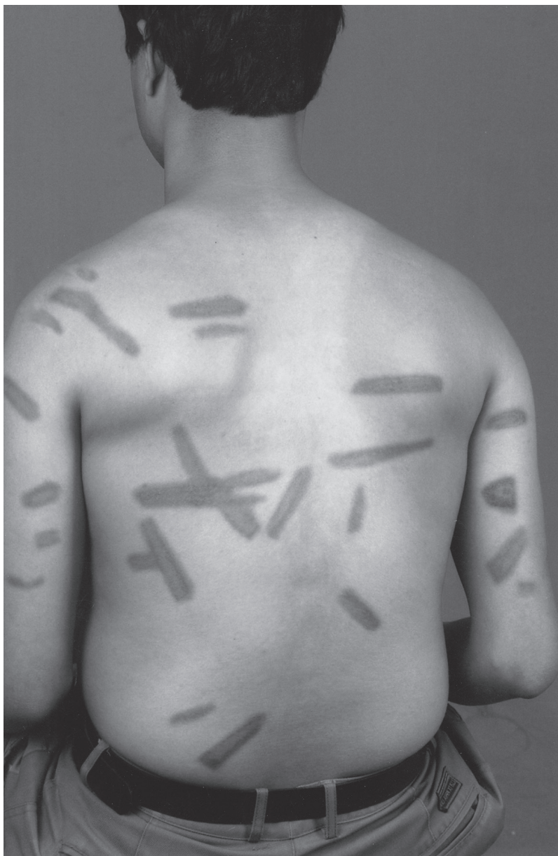
The bruises of torture in army custody